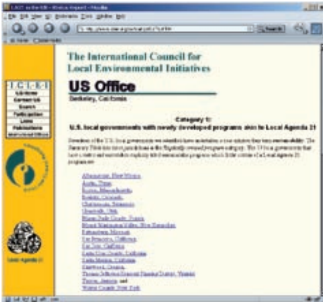
Image 2: The International Council for Local Environmental Initiatives – 1997 report

Essentially, Sustainable Development claims knowledge of all sustainability issues and has stock solutions that can be applied in Stockholm, Boulder, Santa Cruz – indeed, anywhere.